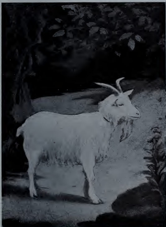
BATTALION MASCOT, "NAN." Presented to Battalion in 1914.